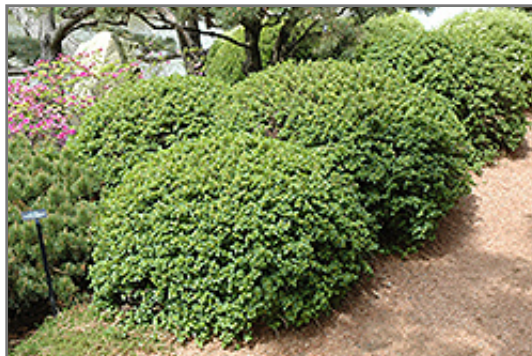
Green Mound Alpine Currant

Green Mound Alpine Currant will grow to be about 3 feet tall at maturity, with a spread of 24 inches. It tends to fill out right to the ground and therefore doesn't necessarily require facer plants in front. It grows at a medium rate, and under ideal conditions can be expected to live for approximately 30 years.