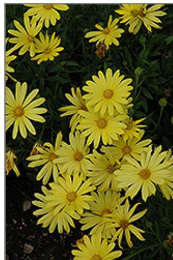
Voltage Yellow African Daisy flowers