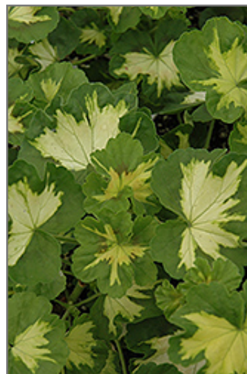
Happy Thought Geranium foliage