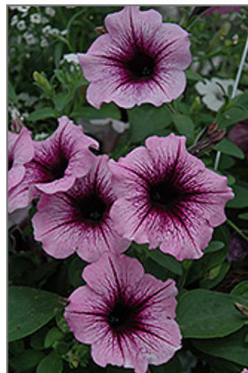
Supertunia Bordeaux Petunia flowers