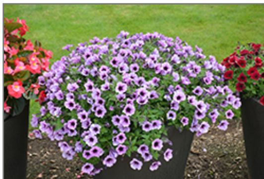
Supertunia Bordeaux Petunia in bloom

Supertunia Bordeaux Petunia is a fine choice for the garden, but it is also a good selection for planting in outdoor containers and hanging baskets. Because of its trailing habit of growth, it is ideally suited for use as a 'spiller' in the 'spiller-thriller-filler' container combination; plant it near the edges where it can spill gracefully over the pot. Note that when growing plants in outdoor containers and baskets, they may require more frequent waterings than they would in the yard or garden.