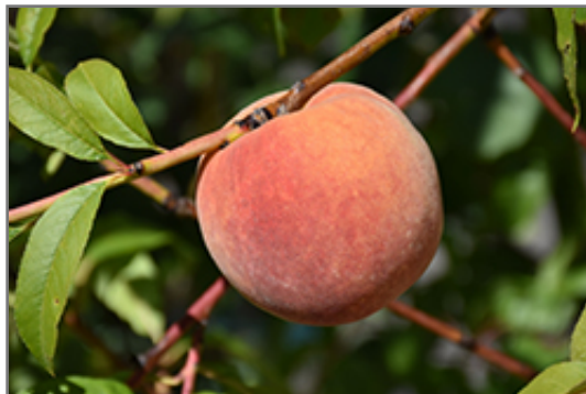
Redhaven Peach fruit

Redhaven Peach is covered in stunning clusters of fragrant pink flowers along the branches in early spring, which emerge from distinctive rose flower buds before the leaves. It has dark green deciduous foliage. The narrow leaves turn yellow in fall. The fruits are showy yellow drupes with a red blush, which are carried in abundance in mid summer. The fruit can be messy if allowed to drop on the lawn or walkways, and may require occasional clean-up.