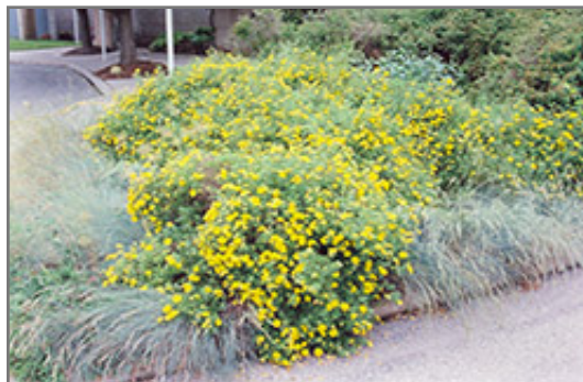
Goldfinger Potentilla in bloom