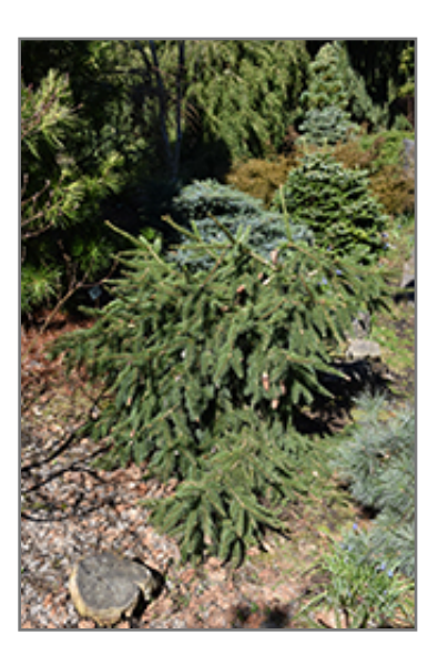
Red Cone Spruce