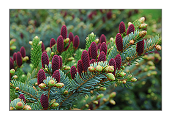
Red Cone Spruce fruit Photo courtesy of NetPS Plant Finder