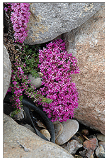
Pink Chintz Creeping Thyme in bloom

This plant should only be grown in full sunlight. It prefers to grow in average to dry locations, and dislikes excessive moisture. It is considered to be drought-tolerant, and thus makes an ideal choice for a low-water garden or xeriscape application. It is not particular as to soil type or pH. It is highly tolerant of urban pollution and will even thrive in inner city environments. Consider covering it with a thick layer of mulch in winter to protect it in exposed locations or colder microclimates. This is a selected variety of a species not originally from North America. It can be propagated by division; however, as a cultivated variety, be aware that it may be subject to certain restrictions or prohibitions on propagation.