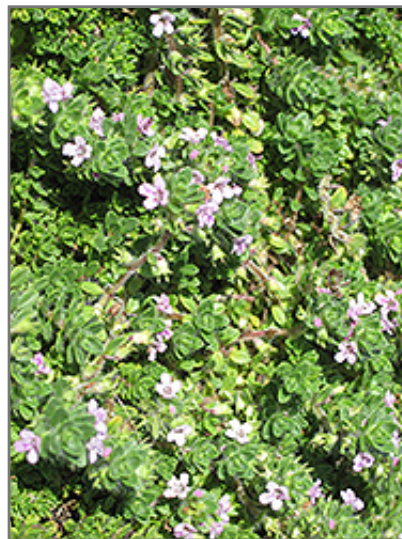
Pink Chintz Creeping Thyme flowers