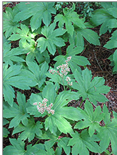
Crimson Fans Mukdenia flowers

Crimson Fans Mukdenia is a fine choice for the garden, but it is also a good selection for planting in outdoor pots and containers. It is often used as a 'filler' in the 'spiller-thriller-filler' container combination, providing a mass of flowers and foliage against which the larger thriller plants stand out. Note that when growing plants in outdoor containers and baskets, they may require more frequent waterings than they would in the yard or garden.