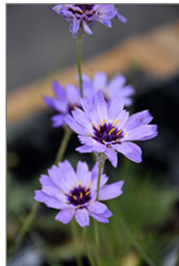
Cupid's Dart flowers