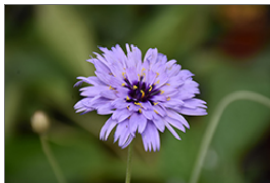
Cupid's Dart flowers