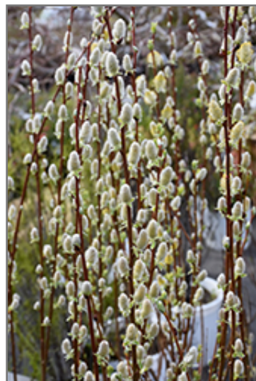
Pussy Willow flowers