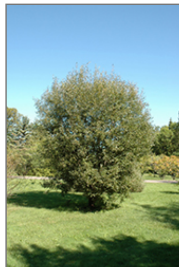
Pussy Willow