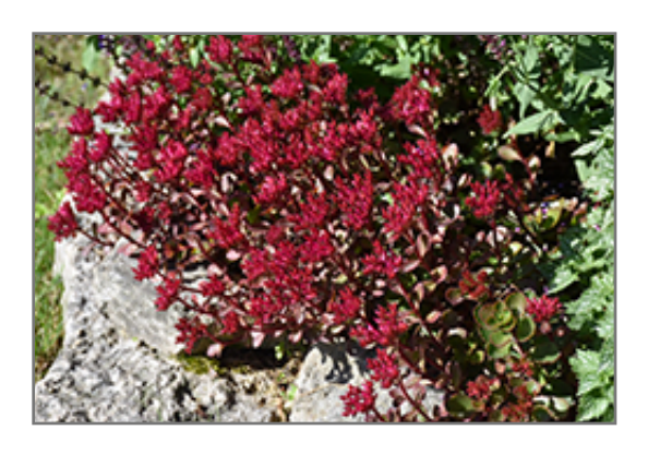
Voodoo Stonecrop in bloom