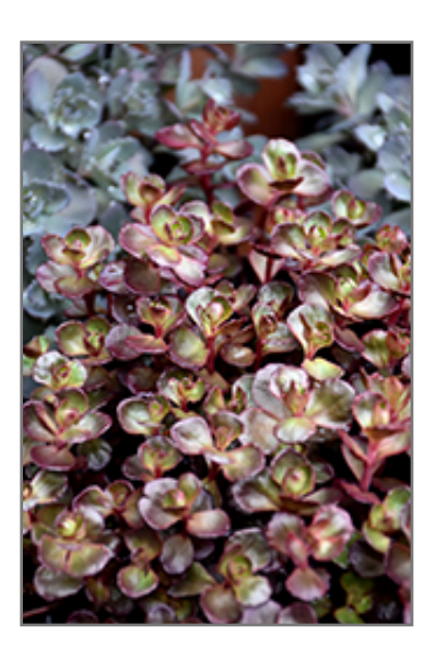
Voodoo Stonecrop foliage