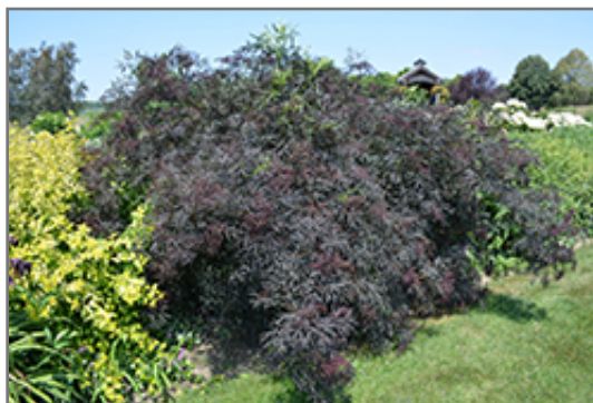
Black Lace Elder