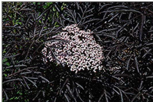
Black Lace Elder flowers