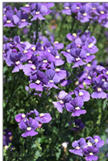
Nesia Denim Nemesia flowers