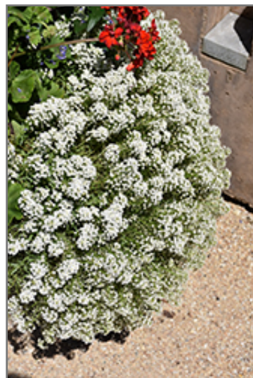
Easy Breezy White Lobularia flowers