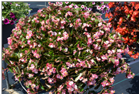
Hula Pink Begonia in bloom

Hula Pink Begonia is a fine choice for the garden, but it is also a good selection for planting in outdoor containers and hanging baskets. Because of its spreading habit of growth, it is ideally suited for use as a 'spiller' in the 'spiller-thriller-filler' container combination; plant it near the edges where it can spill gracefully over the pot. Note that when growing plants in outdoor containers and baskets, they may require more frequent waterings than they would in the yard or garden.