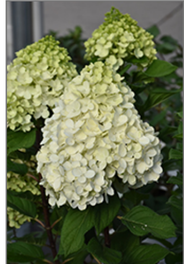
Little Lime Punch Hydrangea flowers