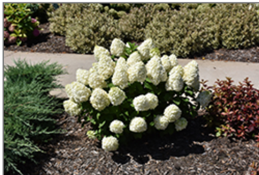
Little Lime Punch Hydrangea in bloom

Little Lime Punch Hydrangea makes a fine choice for the outdoor landscape, but it is also well-suited for use in outdoor pots and containers. With its upright habit of growth, it is best suited for use as a 'thriller' in the 'spiller-thriller-filler' container combination; plant it near the center of the pot, surrounded by smaller plants and those that spill over the edges. It is even sizeable enough that it can be grown alone in a suitable container. Note that when grown in a container, it may not perform exactly as indicated on the tag - this is to be expected. Also note that when growing plants in outdoor containers and baskets, they may require more frequent waterings than they would in the yard or garden.