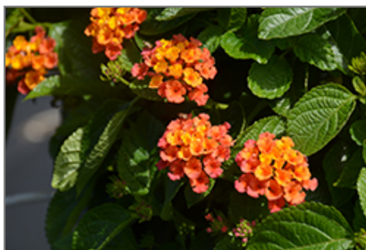
Havana Harvest Moon 2022 Lantana flowers