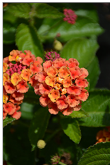
Havana Harvest Moon 2022 Lantana flowers

Havana Harvest Moon 2022 Lantana is recommended for the following landscape applications;