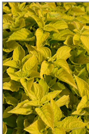
Chartres Street Coleus foliage

Chartres Street Coleus is recommended for the following landscape applications;