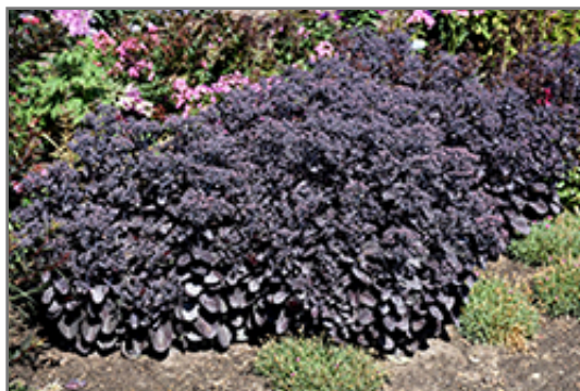
Rock 'N Grow Back in Black Stonecrop in bloom

Rock 'N Grow Back in Black Stonecrop is a dense herbaceous perennial with an upright spreading habit of growth. Its relatively coarse texture can be used to stand it apart from other garden plants with finer foliage.