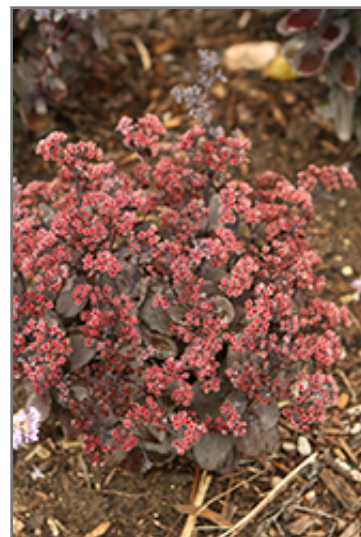
Rock 'N Grow Back in Black Stonecrop flowers

* This is a 'special order' plant - contact store for details