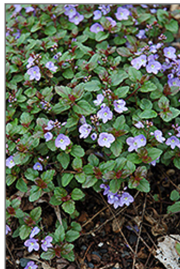
Waterperry Blue Speedwell in bloom