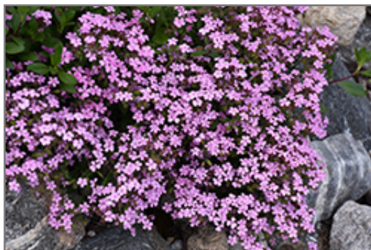
Rock Soapwort in bloom

Rock Soapwort will grow to be only 6 inches tall at maturity, with a spread of 18 inches. When grown in masses or used as a bedding plant, individual plants should be spaced approximately 15 inches apart. Its foliage tends to remain low and dense right to the ground. It grows at a fast rate, and under ideal conditions can be expected to live for approximately 10 years. As an evergreen perennial, this plant will typically keep its form and foliage year-round.