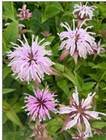
Eastern Beebalm flowers