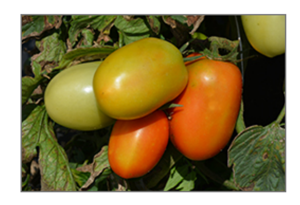
Roma VF Tomato fruit

Roma VF Tomato will grow to be about 3 feet tall at maturity, with a spread of 18 inches. When planted in rows, individual plants should be spaced approximately 3 feet apart. Because of its vigorous growth habit, it may require staking or supplemental support. This fast-growing vegetable plant is an annual, which means that it will grow for one season in your garden and then die after producing a crop.