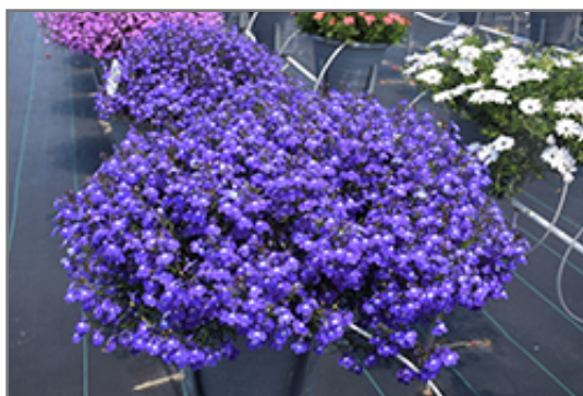
Techno Upright Dark Blue Lobelia in bloom