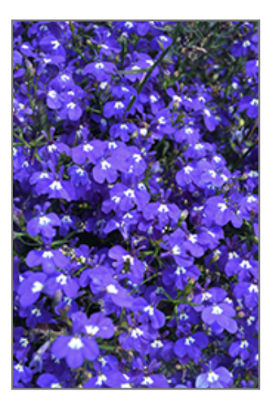
Techno Upright Cobalt Blue Lobelia flowers

This plant will require occasional maintenance and upkeep, and should not require much pruning, except when necessary, such as to remove dieback. It is a good choice for attracting butterflies to your yard. It has no significant negative characteristics.