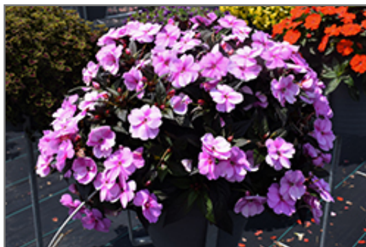
SunPatiens Vigorous Lavender Splash New Guinea Impatiens in bloom

SunPatiens Vigorous Lavender Splash New Guinea Impatiens is a fine choice for the garden, but it is also a good selection for planting in outdoor containers and hanging baskets. Because of its height, it is often used as a 'thriller' in the 'spiller-thriller-filler' container combination; plant it near the center of the pot, surrounded by smaller plants and those that spill over the edges. It is even sizeable enough that it can be grown alone in a suitable container. Note that when growing plants in outdoor containers and baskets, they may require more frequent waterings than they would in the yard or garden.