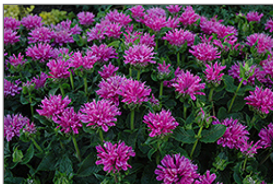
Petite Delight Beebalm flowers