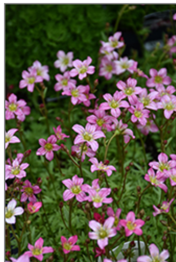
Touran Pink Saxifrage flowers