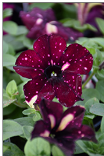
Headliner Starry Sky Burgundy Petunia flowers