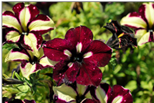
Headliner Starry Sky Burgundy Petunia flowers

Headliner Starry Sky Burgundy Petunia is recommended for the following landscape applications;