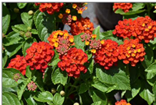
Hot Blooded Red Lantana flowers

Hot Blooded Red Lantana is recommended for the following landscape applications;