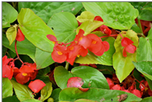
Canary Wings Begonia flowers