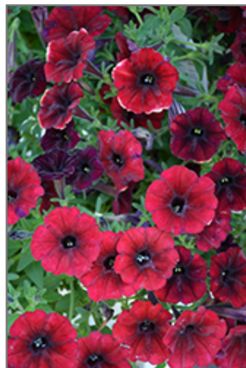
Supertunia Black Cherry Petunia flowers

This plant will require occasional maintenance and upkeep. Trim off the flower heads after they fade and die to encourage more blooms late into the season. It is a good choice for attracting butterflies and hummingbirds to your yard, but is not particularly attractive to deer who tend to leave it alone in favor of tastier treats. It has no significant negative characteristics.