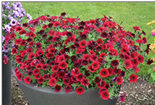
Supertunia Black Cherry Petunia in bloom

Supertunia Black Cherry Petunia is a fine choice for the garden, but it is also a good selection for planting in outdoor containers and hanging baskets. Because of its trailing habit of growth, it is ideally suited for use as a 'spiller' in the 'spiller-thriller-filler' container combination; plant it near the edges where it can spill gracefully over the pot. Note that when growing plants in outdoor containers and baskets, they may require more frequent waterings than they would in the yard or garden.