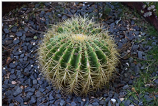
Golden Barrel Cactus

Golden Barrel Cactus is a succulent evergreen plant. It is a member of the cactus family, which are grown primarily for their characteristic shapes, their interesting features and textures, and their high tolerance for hot, dry growing environments. Like all cacti, it doesn't actually have leaves, but rather modified succulent stems that comprise the bulk of the plant, and which are designed to hold water for long periods of time. This particular cactus is valued for its distinctive barrel shape, and usually grows as a single spiny ribbed green stem. This plant has yellow cup-shaped flowers held atop the stems from late spring to early summer, which are interesting on close inspection.