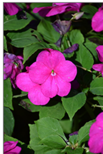
Beacon Violet Shades Impatiens flowers