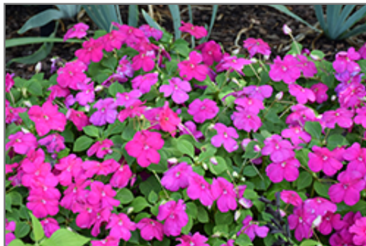
Beacon Violet Shades Impatiens flowers

Beacon Violet Shades Impatiens is recommended for the following landscape applications;