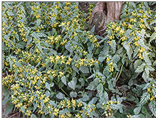
Hermann's Pride Yellow Archangel in bloom

This plant does best in partial shade to shade. It is an amazingly adaptable plant, tolerating both dry conditions and even some standing water. It is considered to be drought-tolerant, and thus makes an ideal choice for a low-water garden or xeriscape application. It is not particular as to soil type or pH. It is highly tolerant of urban pollution and will even thrive in inner city environments. This is a selected variety of a species not originally from North America. It can be propagated by division; however, as a cultivated variety, be aware that it may be subject to certain restrictions or prohibitions on propagation.