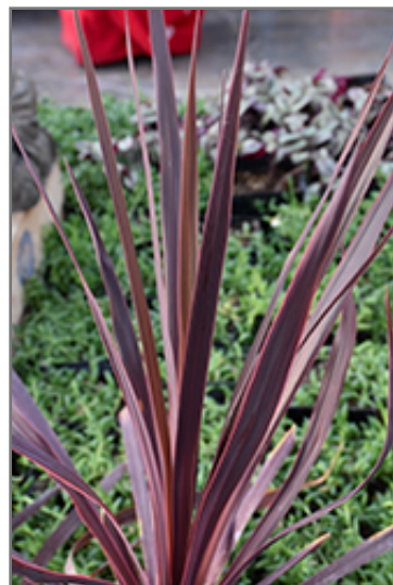
Black Knight Grass Palm foliage