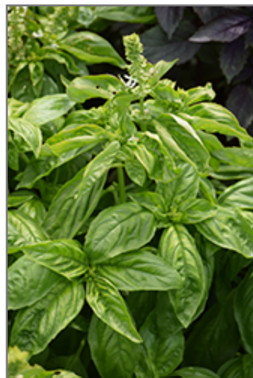
Genovese Basil foliage

This plant can be integrated into a landscape or flower garden by creative gardeners, but is usually grown in a designated herb garden. It should only be grown in full sunlight. It prefers to grow in average to moist conditions, and shouldn't be allowed to dry out. It is not particular as to soil type or pH. It is somewhat tolerant of urban pollution. This is a selected variety of a species not originally from North America. It can be propagated by cuttings; however, as a cultivated variety, be aware that it may be subject to certain restrictions or prohibitions on propagation.