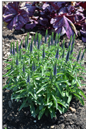
Magic Show Wizard of Ahhs Speedwell in bloom

* This is a 'special order' plant - contact store for details