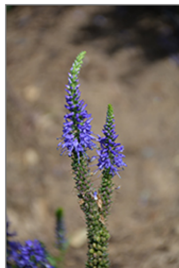
Magic Show Wizard of Ahhs Speedwell flowers