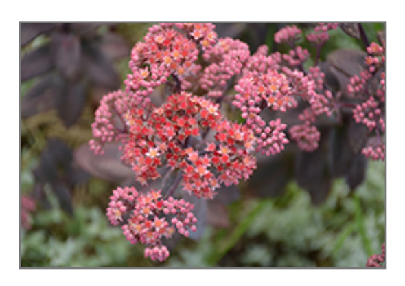
Night Embers Stonecrop flowers