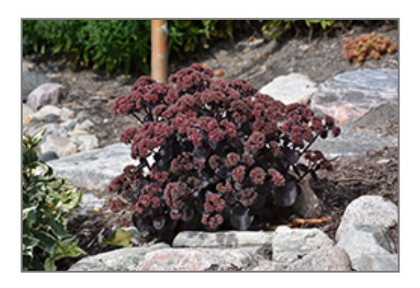
Night Embers Stonecrop in bloom

This is a relatively low maintenance plant, and is best cleaned up in early spring before it resumes active growth for the season. It is a good choice for attracting bees and butterflies to your yard, but is not particularly attractive to deer who tend to leave it alone in favor of tastier treats. It has no significant negative characteristics.