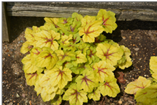
Catching Fire Foamy Bells

Catching Fire Foamy Bells is recommended for the following landscape applications;