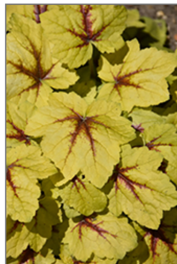
Catching Fire Foamy Bells foliage