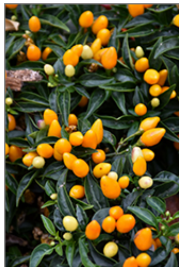
Sedona Sun Ornamental Pepper fruit

Sedona Sun Ornamental Pepper is an herbaceous annual with an upright spreading habit of growth. Its medium texture blends into the garden, but can always be balanced by a couple of finer or coarser plants for an effective composition.