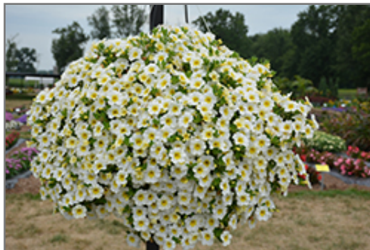
MiniFamous Neo White + Yellow Eye Calibrachoa in bloom

MiniFamous Neo White + Yellow Eye Calibrachoa is a fine choice for the garden, but it is also a good selection for planting in outdoor containers and hanging baskets. Because of its trailing habit of growth, it is ideally suited for use as a 'spiller' in the 'spiller-thriller-filler' container combination; plant it near the edges where it can spill gracefully over the pot. Note that when growing plants in outdoor containers and baskets, they may require more frequent waterings than they would in the yard or garden.