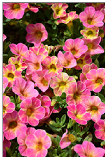
Chameleon Sunshine Berry Calibrachoa flowers

This plant will require occasional maintenance and upkeep. Trim off the flower heads after they fade and die to encourage more blooms late into the season. It is a good choice for attracting bees and hummingbirds to your yard, but is not particularly attractive to deer who tend to leave it alone in favor of tastier treats. It has no significant negative characteristics.