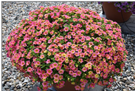
Chameleon Sunshine Berry Calibrachoa in bloom

Chameleon Sunshine Berry Calibrachoa is a fine choice for the garden, but it is also a good selection for planting in outdoor containers and hanging baskets. Because of its trailing habit of growth, it is ideally suited for use as a 'spiller' in the 'spiller-thriller-filler' container combination; plant it near the edges where it can spill gracefully over the pot. Note that when growing plants in outdoor containers and baskets, they may require more frequent waterings than they would in the yard or garden.