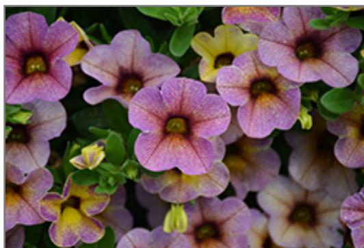
Chameleon Blueberry Scone Calibrachoa flowers