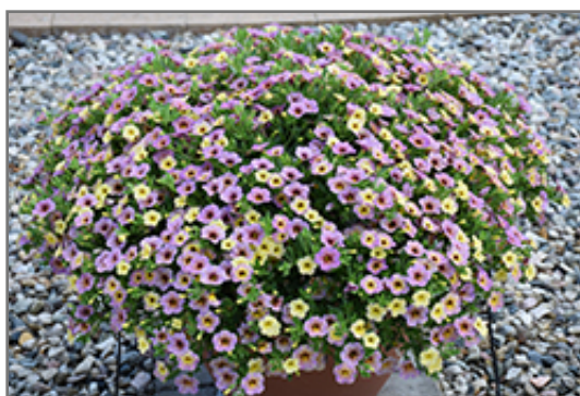
Chameleon Blueberry Scone Calibrachoa in bloom