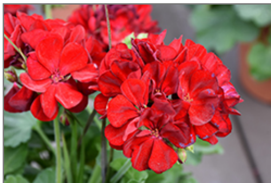
Calliope Medium Dark Red Geranium flowers