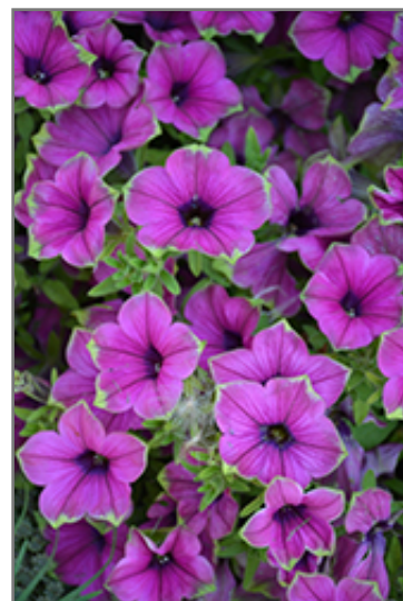
Supertunia Picasso In Purple Petunia flowers