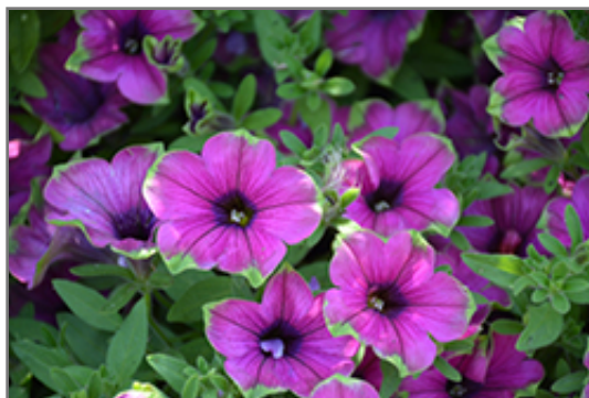
Supertunia Picasso In Purple Petunia flowers

This plant will require occasional maintenance and upkeep. Trim off the flower heads after they fade and die to encourage more blooms late into the season. It is a good choice for attracting butterflies and hummingbirds to your yard, but is not particularly attractive to deer who tend to leave it alone in favor of tastier treats. It has no significant negative characteristics.