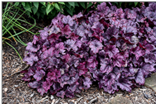
Wild Rose Coral Bells

Wild Rose Coral Bells is recommended for the following landscape applications;