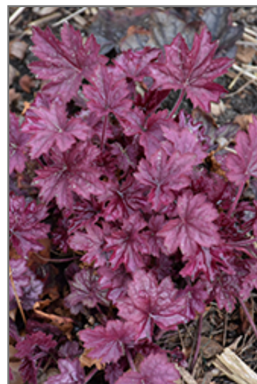
Wild Rose Coral Bells foliage