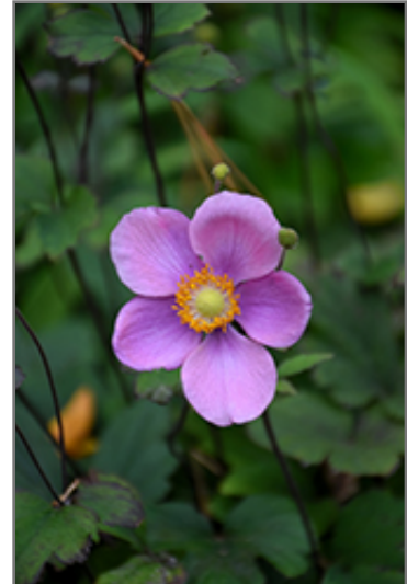
Lucky Charm Anemone flowers