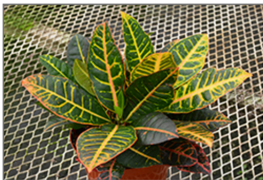
Petra Variegated Croton in full